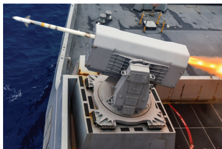
Missile Launchers/ Weapons Systems