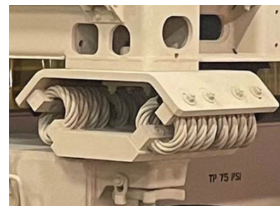
Force Protection for Rugged Vehicles